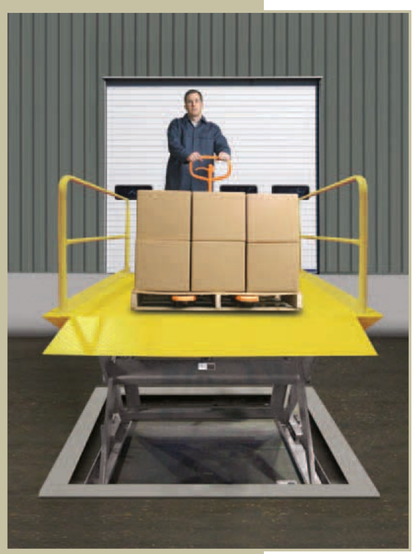
M - Series dock lift featuring Dura-Dock<sup>™</sup> weatherproof construction.