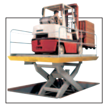
H - Series dock lift for heavy loads (over 10,000 lbs.) and/or forklift accessibility.

Southworth offers seven standard dock lift models with capacities from 5,000 to 20,000 lbs., platform sizes up to 8' x 12' and a variety of installation configurations to accommodate any loading dock requirement. Models featuring an "M" designation are built for use with two wheel dollies, hand carts, and hand pallet trucks. "H" model designations can be used with powered devices like powered pallet trucks, counterbalanced stackers and fork lift trucks.